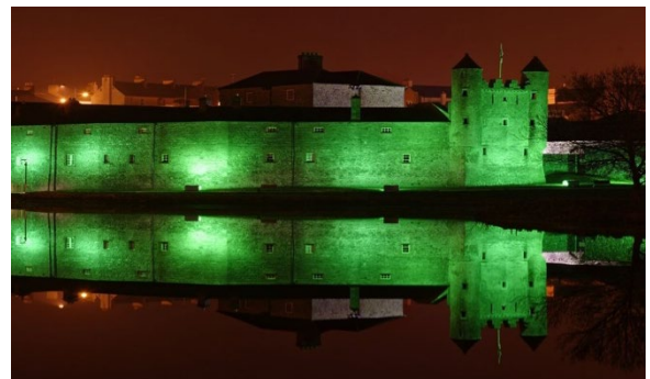
Figure 3: Enniskillen Castle Museum in Northern Ireland