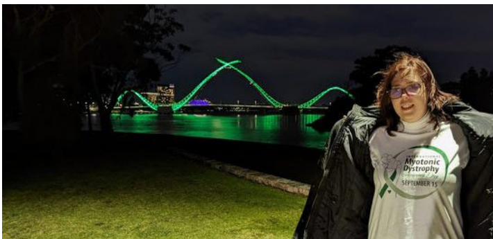
Figure 2: Matagarup Bridge in Perth, Australia