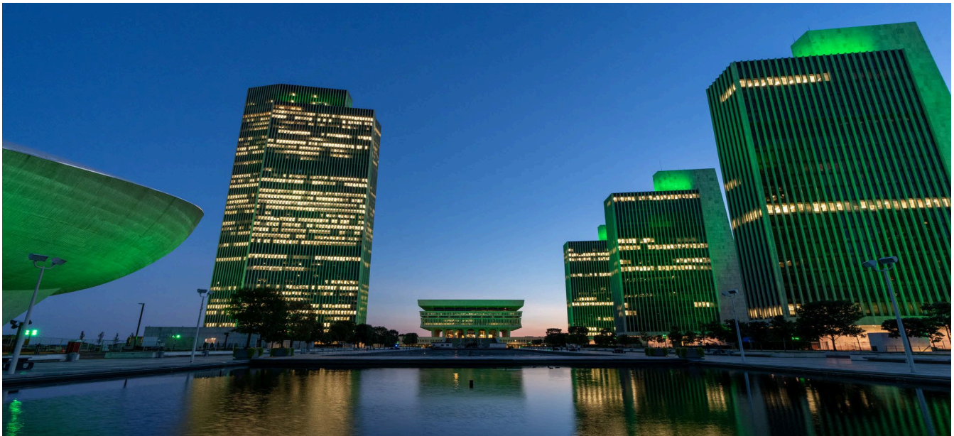
Figure 1: Empire State Plaza in Albany, New York

Since the first International DM Awareness Day in 2021, dozens of buildings have lit up in green across the US and the world, including the NY State Capitol building, the Matagarup Bridge in Perth, Australia, windmills in the Netherlands, castles in the UK, and more! This initiative increases DM visibility across communities and social media (not to mention it is a great photo opportunity!).